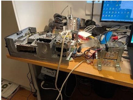
Copying an image to a real 8 inch diskette

I then copied the image to a real diskette 1, and run it on the hardware: